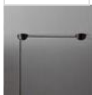
AGGREGATO SOSP ROSONE DECENT A086000