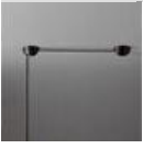
AGGREGATO SOSP ROSONE DECENT A086000