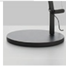
DEMETRA LED T BASE GRO 1733010A