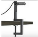
DEMETRA MORSETTO GRO 1744010A