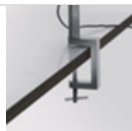
DEMETRA MORSETTO TITANIO 1744030A