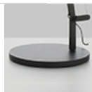
DEMETRA LED T BASE TITANIO 1733030A